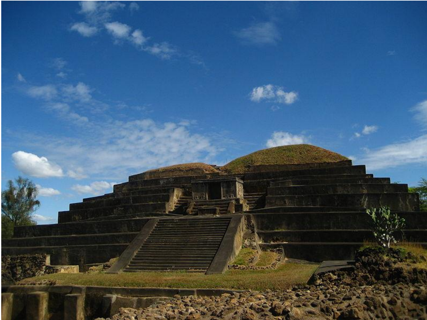
Mayan temple of Tazumal