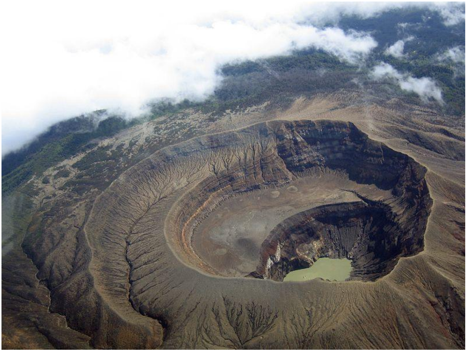
Volcano of Santa Ana