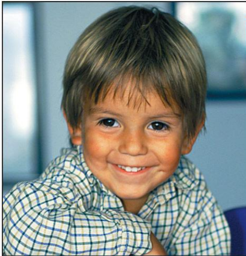
El niño rubio es de España. The blond boy is from Spain.