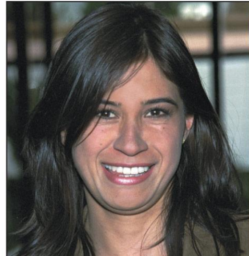
La mujer española habla inglés. The Spanish woman speaks English.